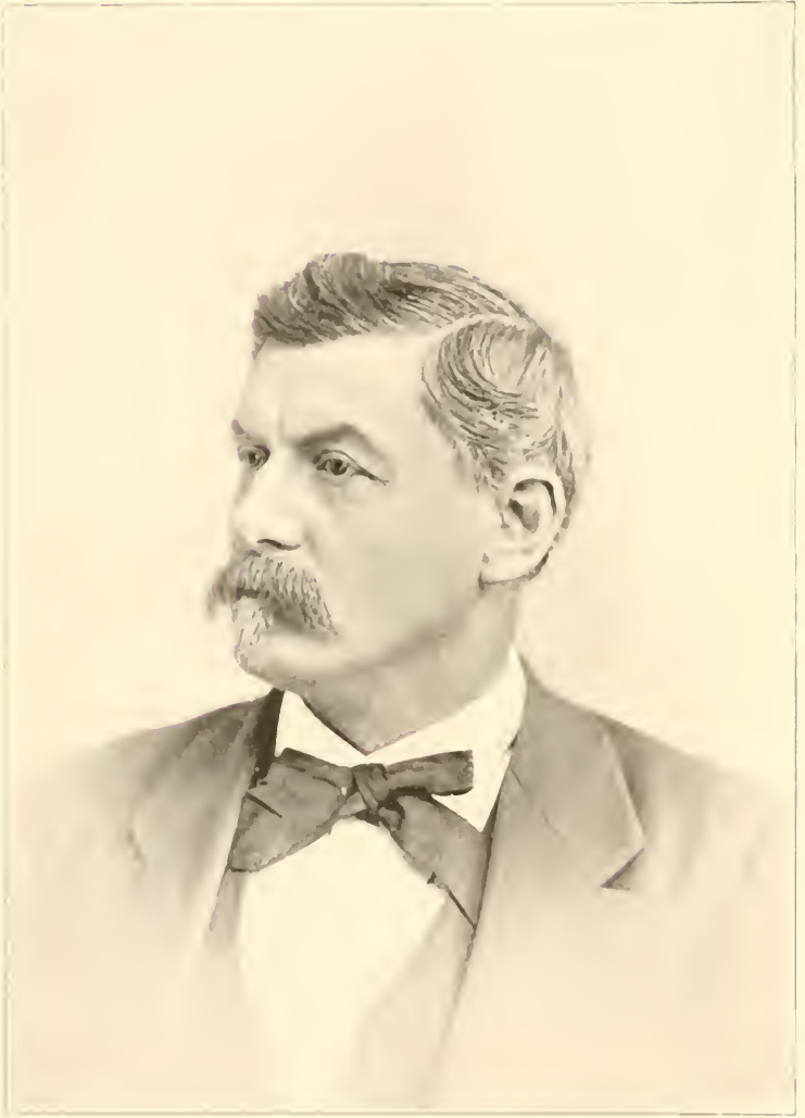
MAJOR GENERAL GEORGE B. MCCLELLAN, U. S. A.